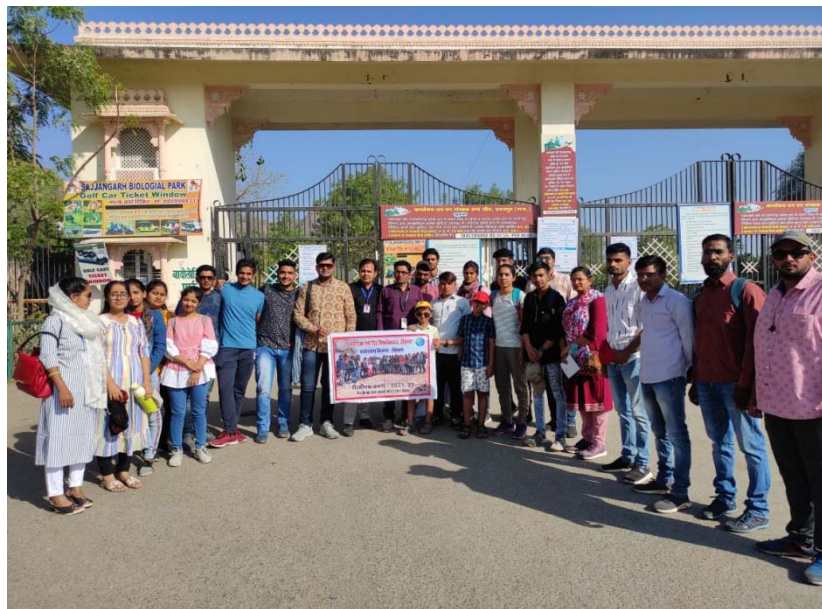
Educational Tour jointly organized by the Department of Environment Science and Department of Geography in April 2022