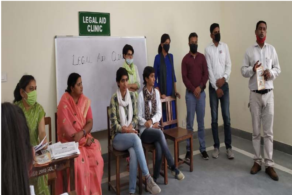
Functional Legal Aid Clinic 2020-21