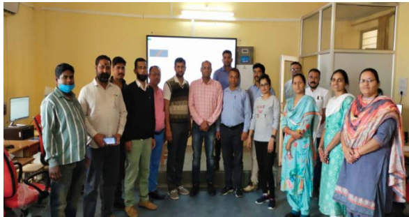
SDP Phase I: participants with experts after the session