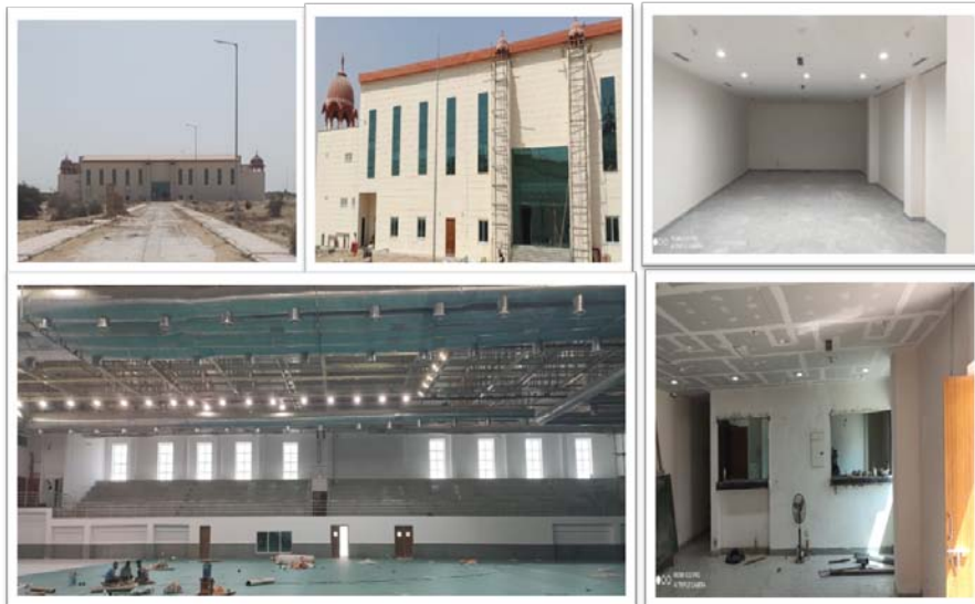
Photographs of the Indoor Stadium

Budget of the university: budget for Sports Complex is highlighted