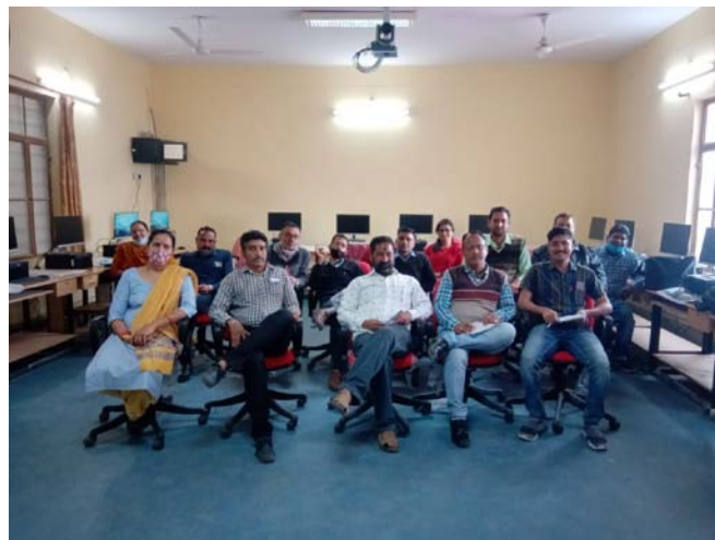
SDP Phase I: Non-teaching staff during theory class

The first batch of this SDP was organized from 03-24 March 2022.