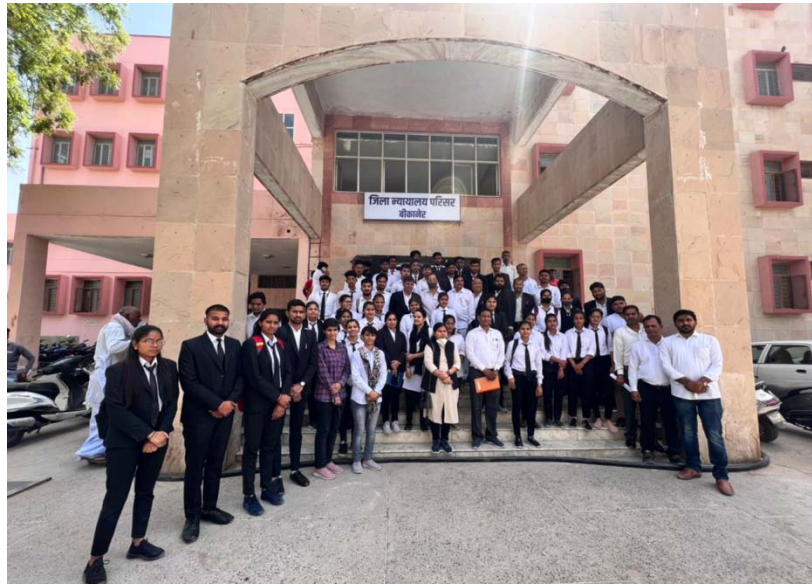
Students visiting the court at Bikaner (2022)