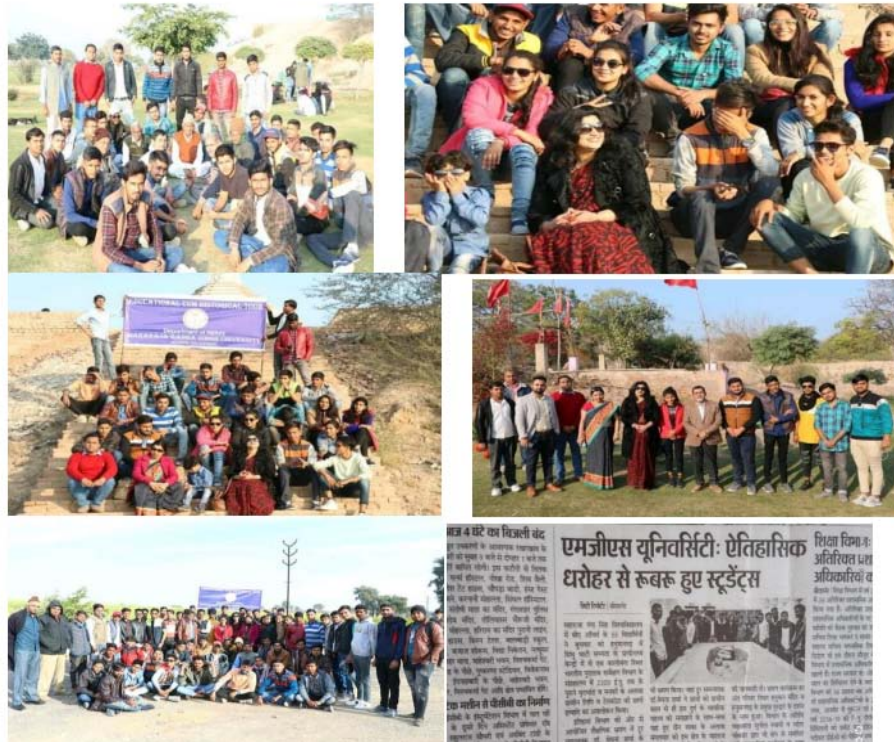
Educational tour organized by department of History 2019-20