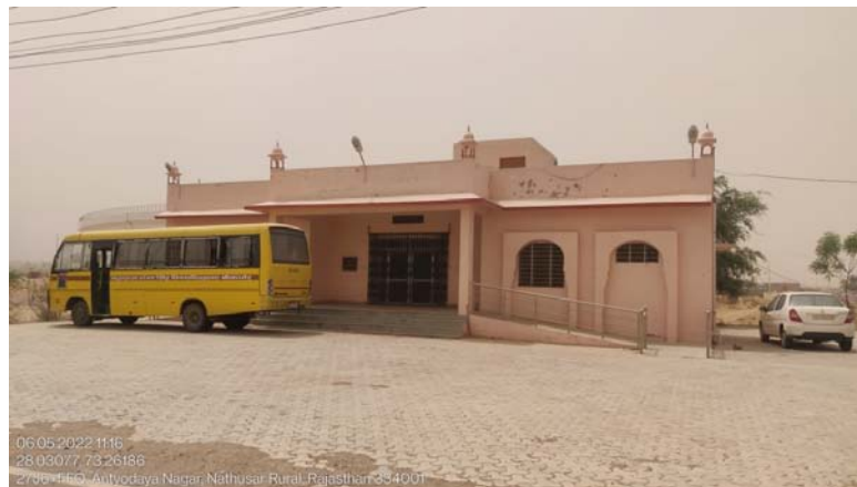
Photograph of newly purchased bus

The University had two buses for transportation purposes. Recently, the University has purchased one more bus to facilitate the transport of the students.