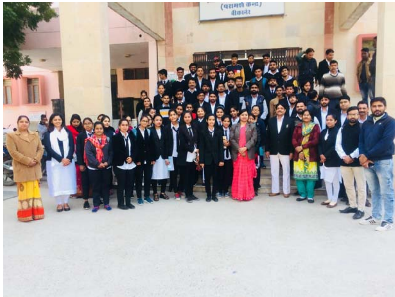
Students visiting the court at Bikaner (2021)

Internship programs and court visits are regular features of the department of law but due to the COVID crisis, permission for court visits was not granted. These activities on the campus have been resumed.