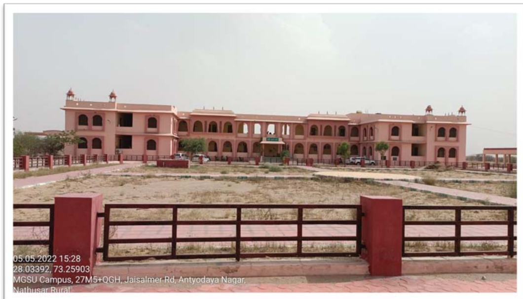
Academic Block 1