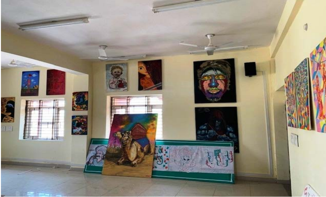
Drawing & Painting Lab