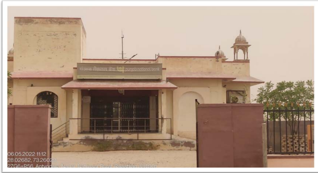
PNB Bank, MGSU Branch