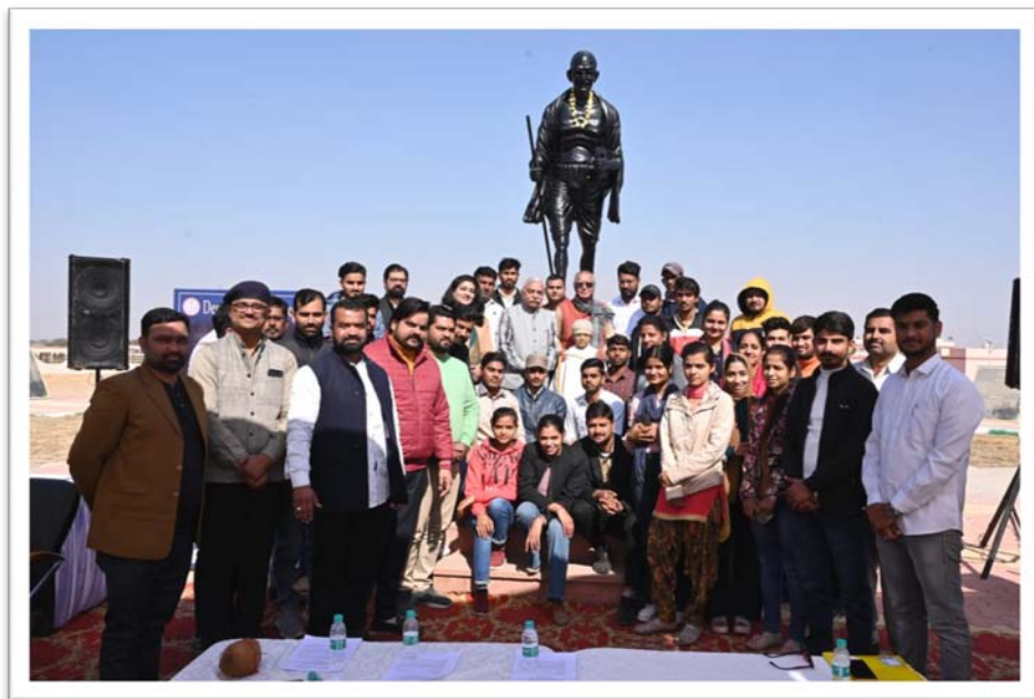
Mahatma Gandhi Smarak