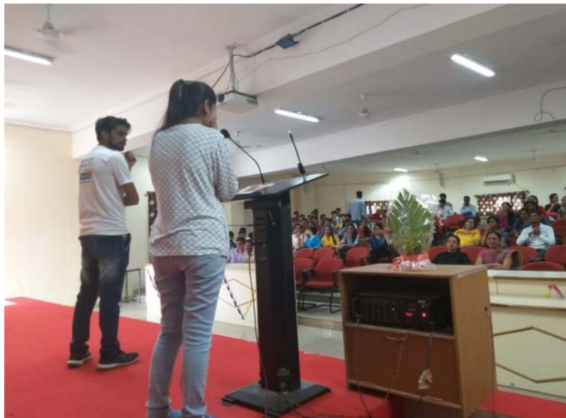
Auditoriums in each Academic Building