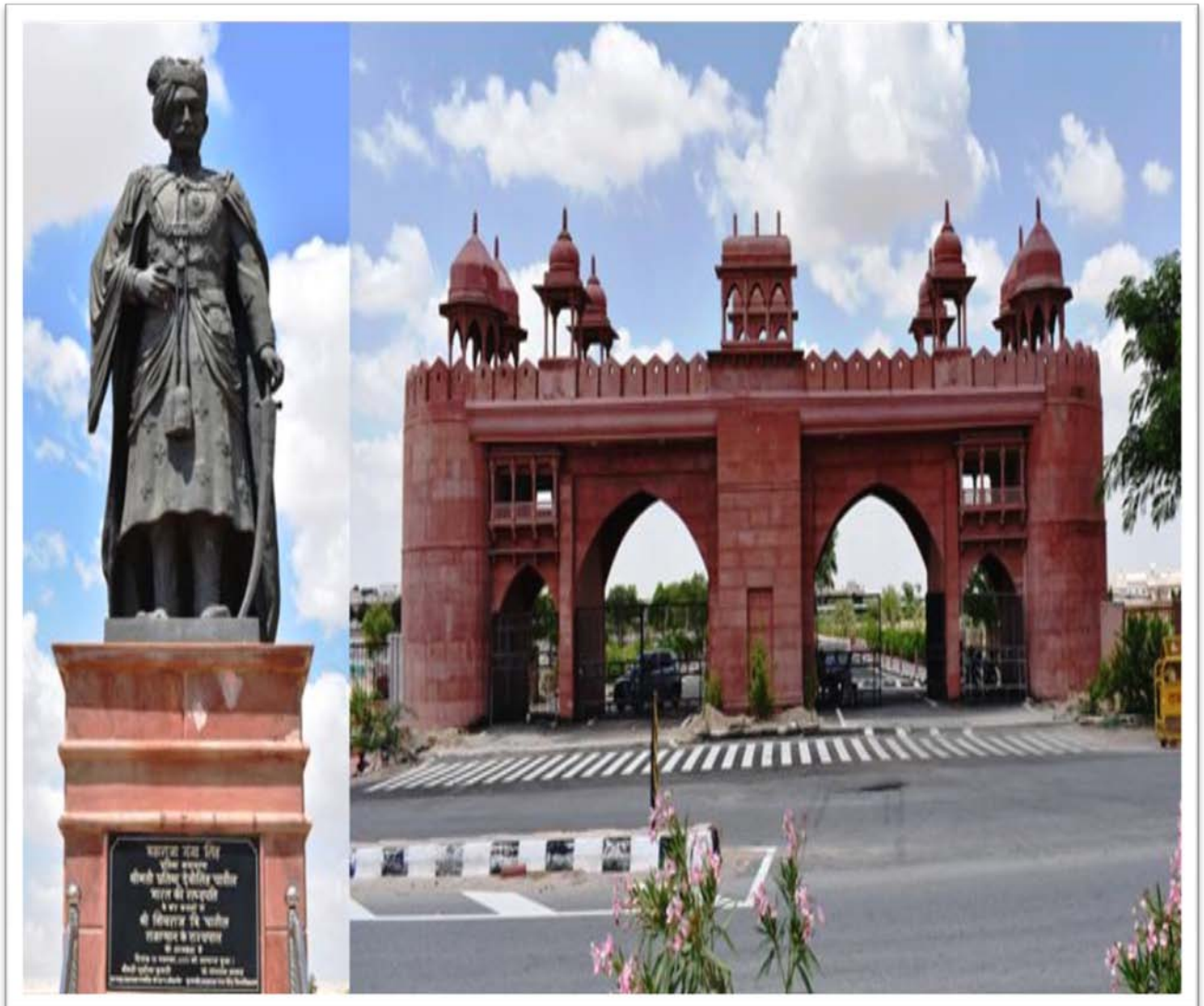
Main Gate of MGSU