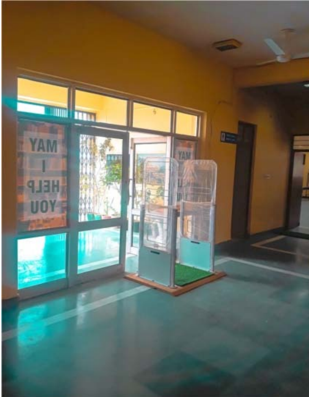
MGSU Central Library with RFID System