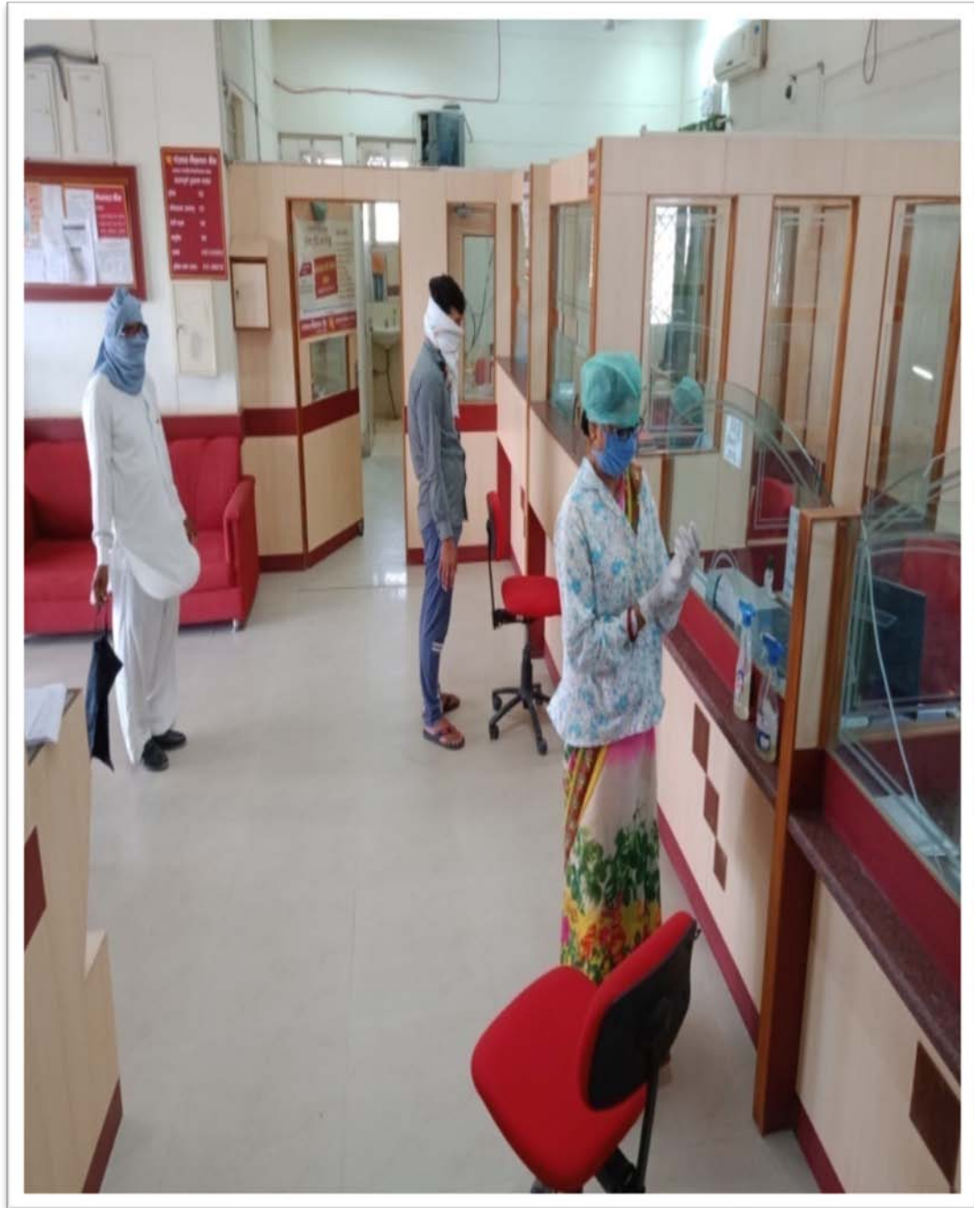
PNB Bank Branch, MGSU