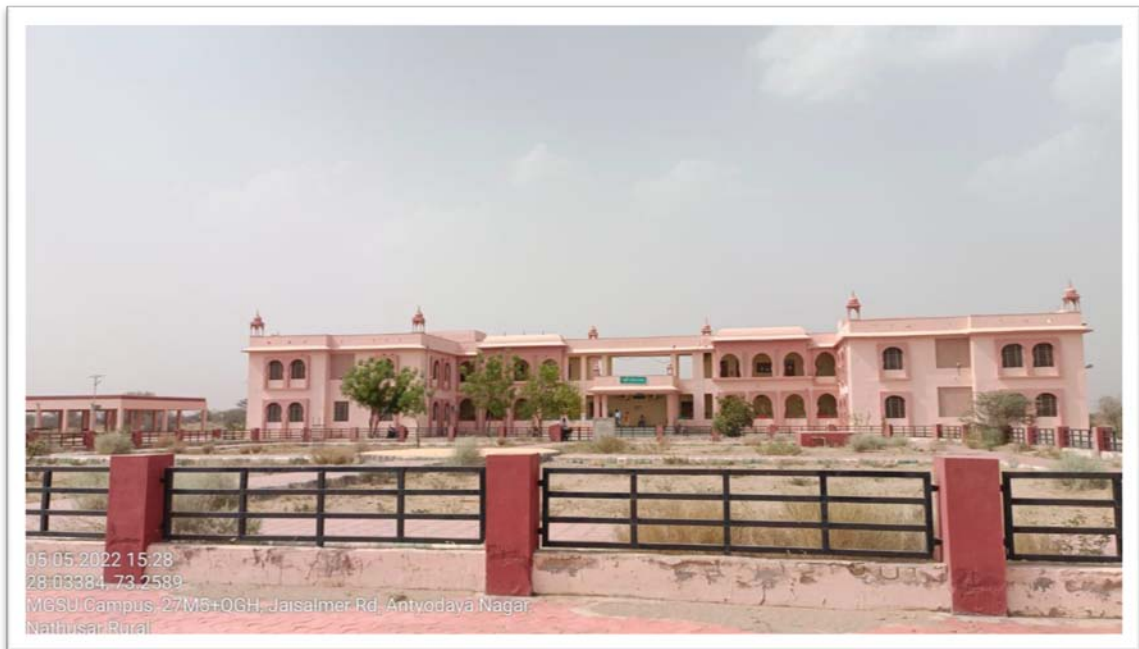
Academic Block II