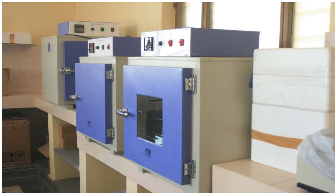
Environmental Science Lab