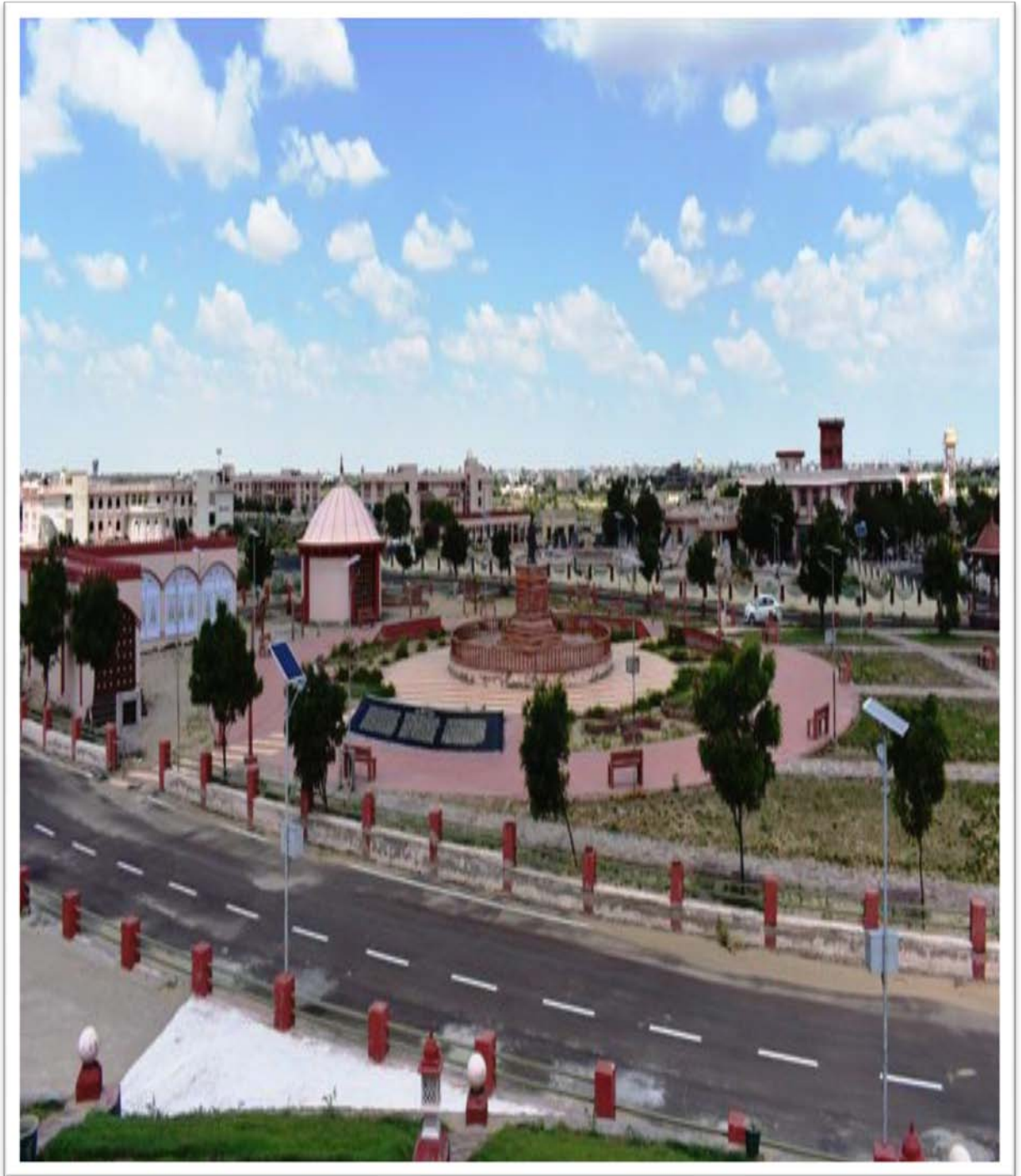
MGSU at A Glance