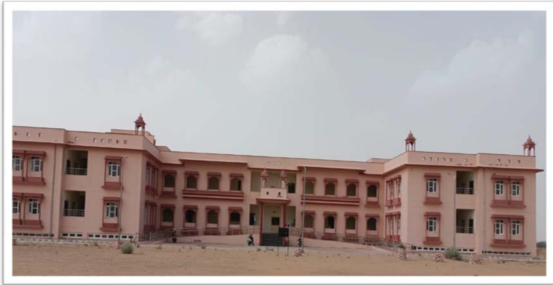
Academic Block IV