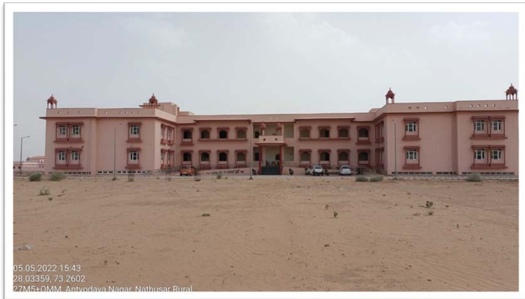
Academic Block III