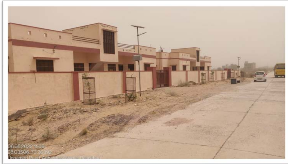
Staff Quarters (04)