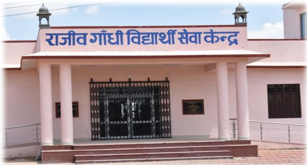
Rajiv Gandhi Student Facility Centre