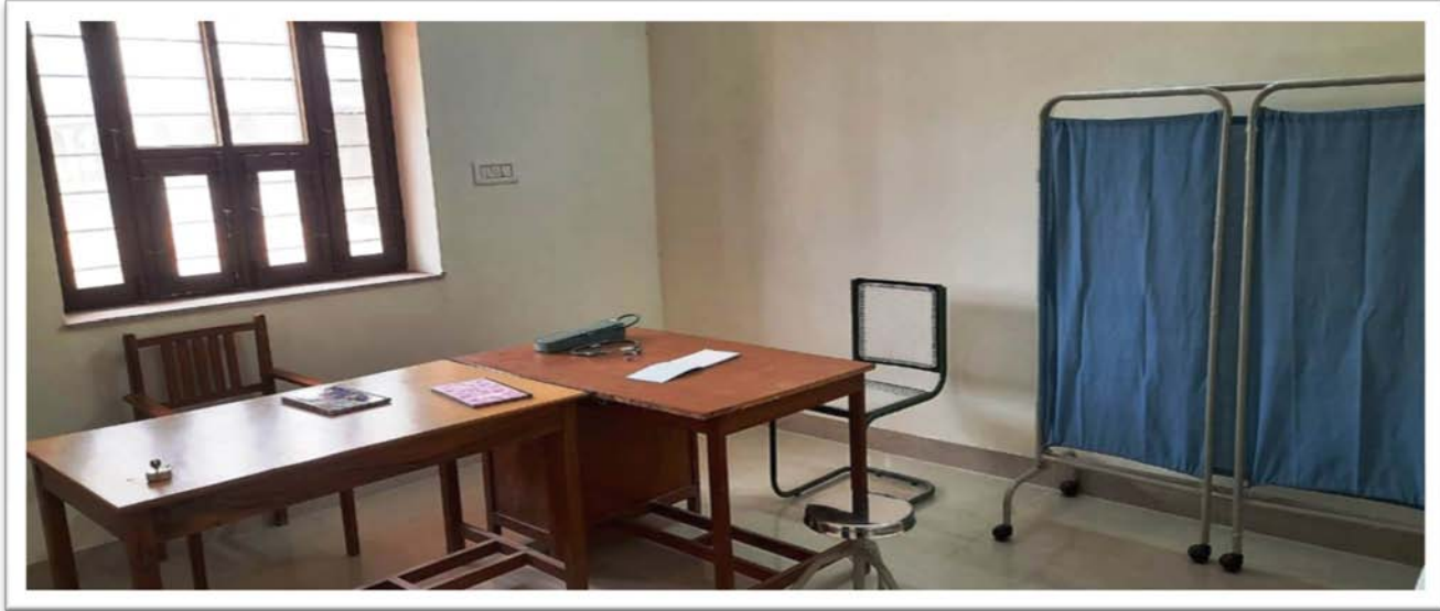
Dispensary at MGSU